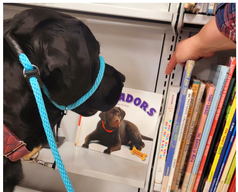
Charlie the therapy dog inspecting the library's collection of books on Labradors at our recent Storytime Explorers—he approves!

LEBANON COMMUNITY LIBRARY 125 N. 7th St. Lebanon, PA 17046 717-273-7624 lebanon.lclibs.org